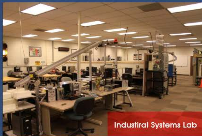
Industrial Systems Lab