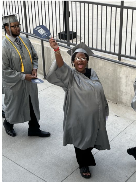
Figure 8 WIOA Recipients at CGTC Graduation