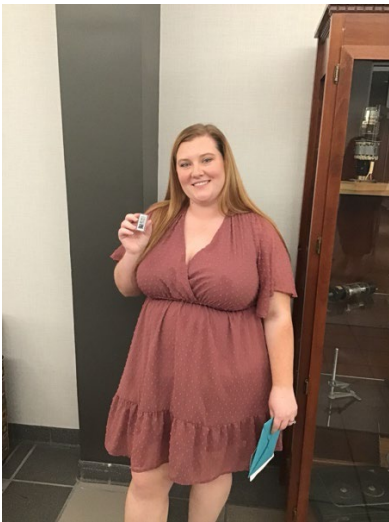
Figure 3 Radiologic Technology Pinning Ceremony