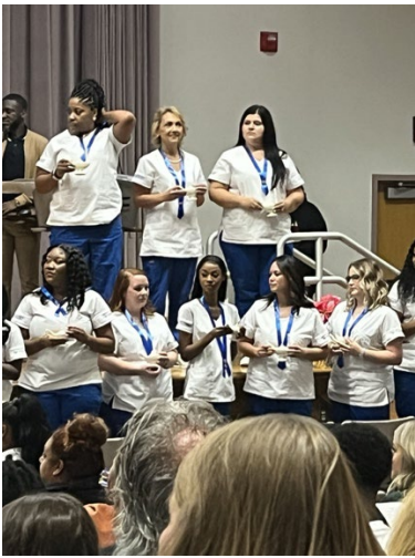
Figure 4 LPN Pinning Ceremony