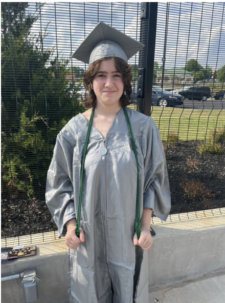
Figure 9 WIOA Recipients at CGTC Graduation

Additional information about the WIOA program at CGTC can be found at www.centralgatech.edu/wioa .