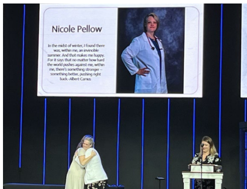
Figure 1 ASN Pinning Ceremony

WIOA Career advisors participated in assisting students with completing exit surveys at graduation. In addition, Advisors supported their WIOA funded students at various pinning ceremonies across the College as pictured below.