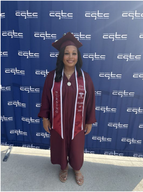
Figure 7 WIOA Recipients at CGTC Graduation