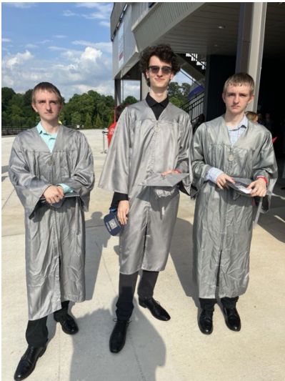
Figure 6 WIOA Recipients at CGTC Graduation