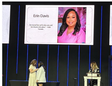
Figure 2 ASN Pinning Ceremony