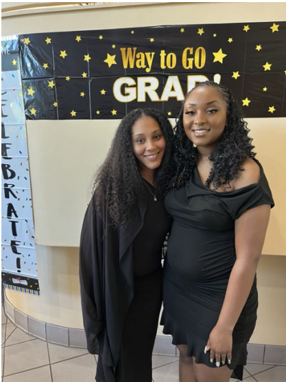
Figure 5 Dental Hygiene Pinning Ceremony