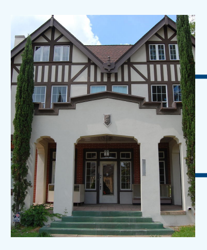
The Aliman Brothers Band Museum 2321 Vineville Ave. Macon, GA 31204 ( Open 11:00 am - 4:00 pm )