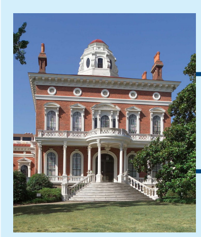
The Hay House 934 Georgia Ave. Macon, GA 31201 (Open 1:00 pm - 4:00 pm)